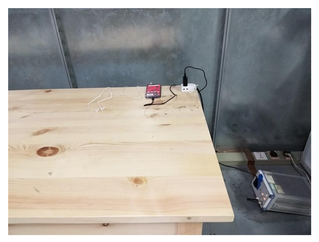
Test Setup Photo of Power Line Conducted Measurement