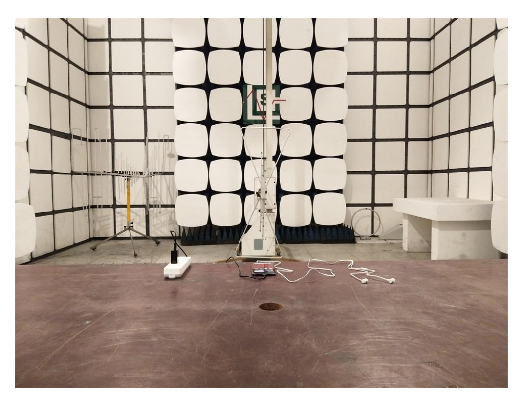
Test Setup Photo of Radiated Measurement (30MHz~1GHz)