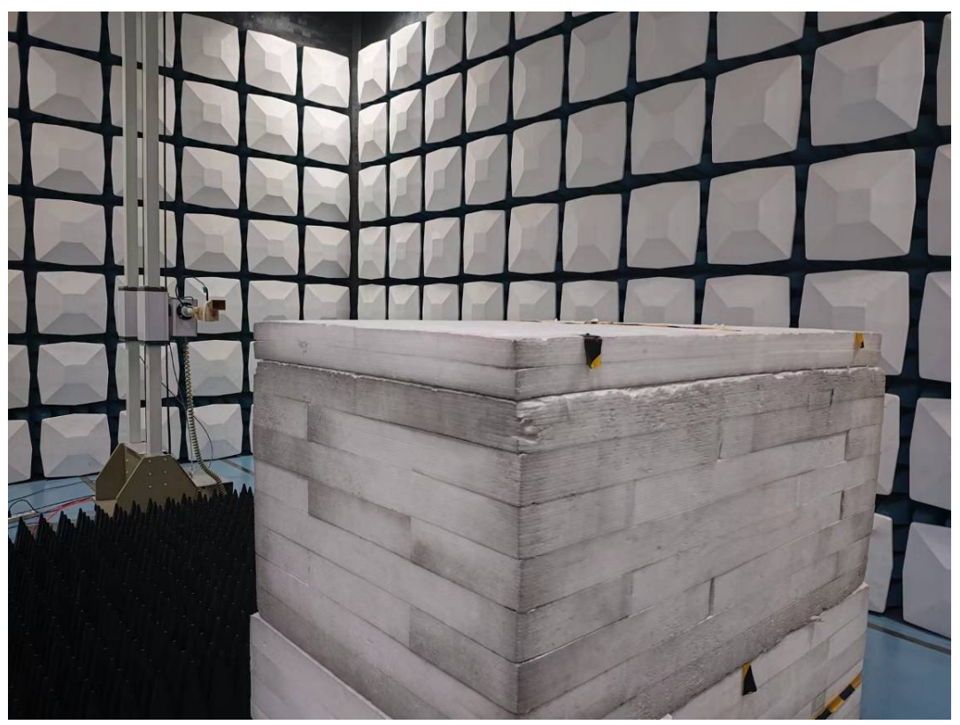
Radiated Emission 18-25GHz View