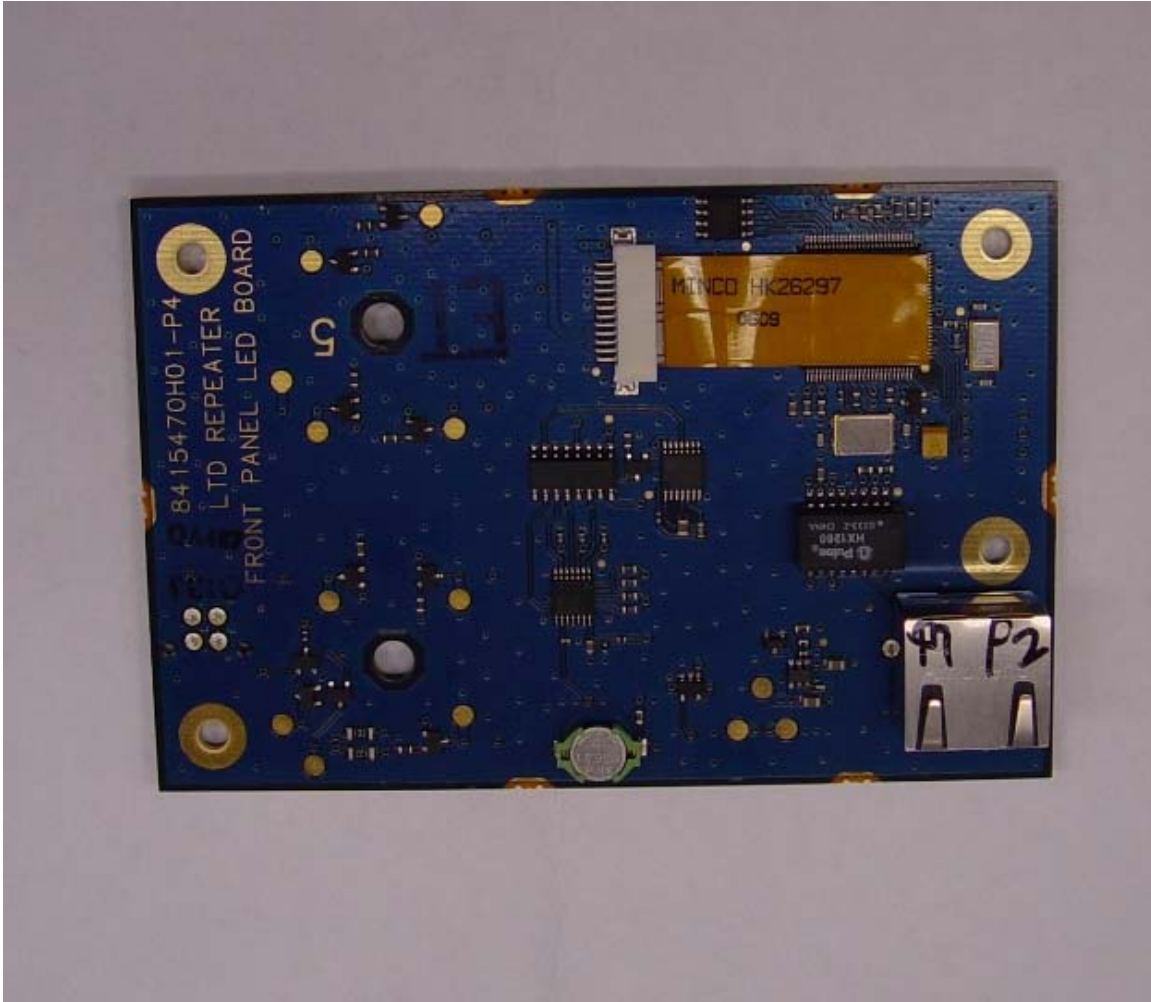
TOP VIEW OF FRONT PANEL LED BOARD