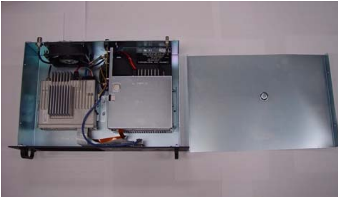
TOP VIEW OF WITH TOP COVER REMOVED