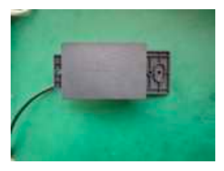
Figure 3 .Wireless charging area

Equipment Name: Wireless charger Model Name: PWC02