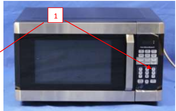
New front view

Back is basically identical to original.