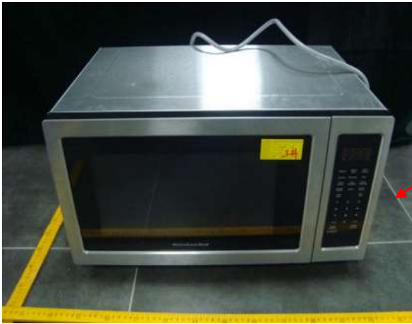
Original front view