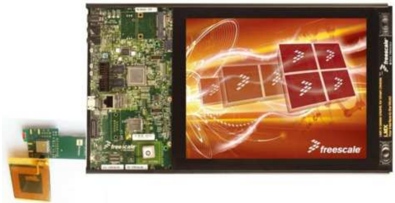
The SPB209A-EVK with SPB209A module and a custom NFC antenna connected to a i.MX6 DL Linux Host Platform.