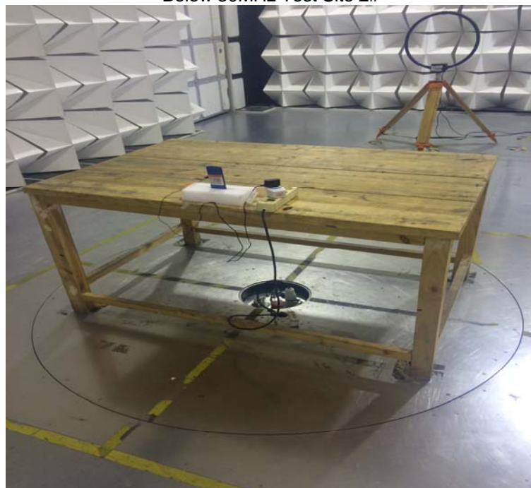
Below 30MHz Test Site 2#