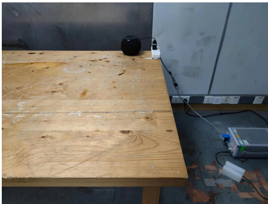
Photo of Conducted Emission Measurement