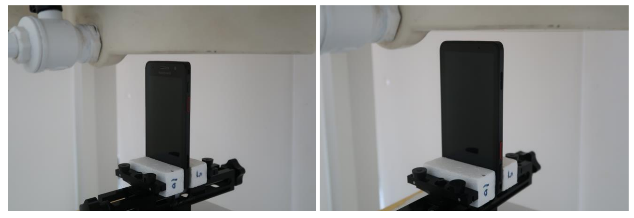
Top side at 10mm