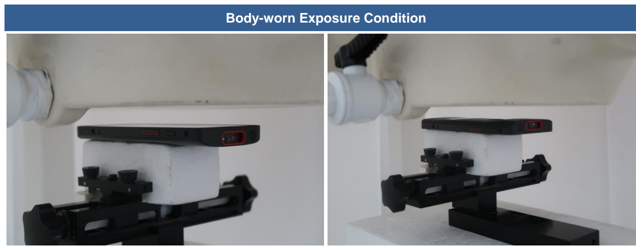
Front at 15mm