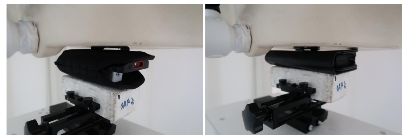
Back with Holster 1 at 0mm