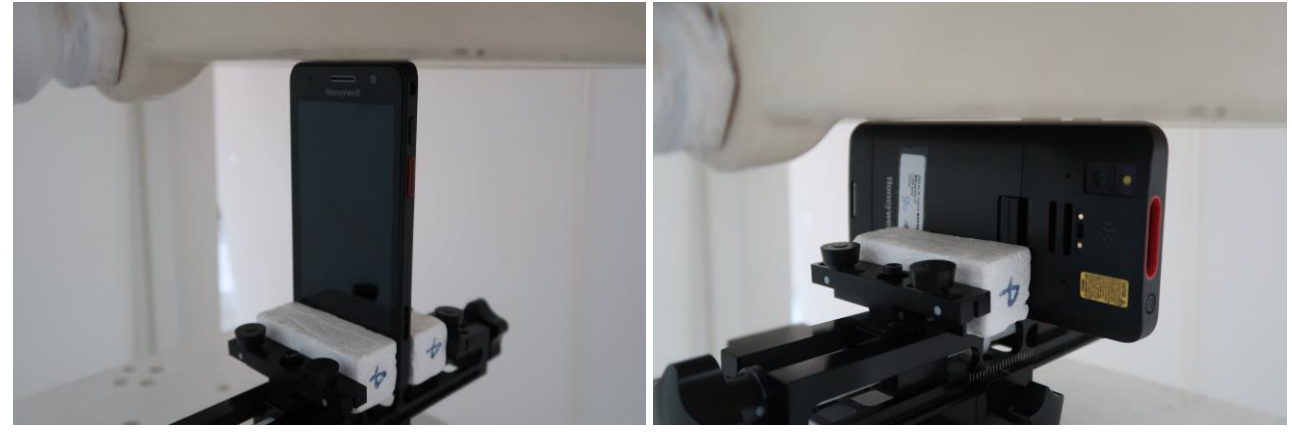
Top side at 0mm