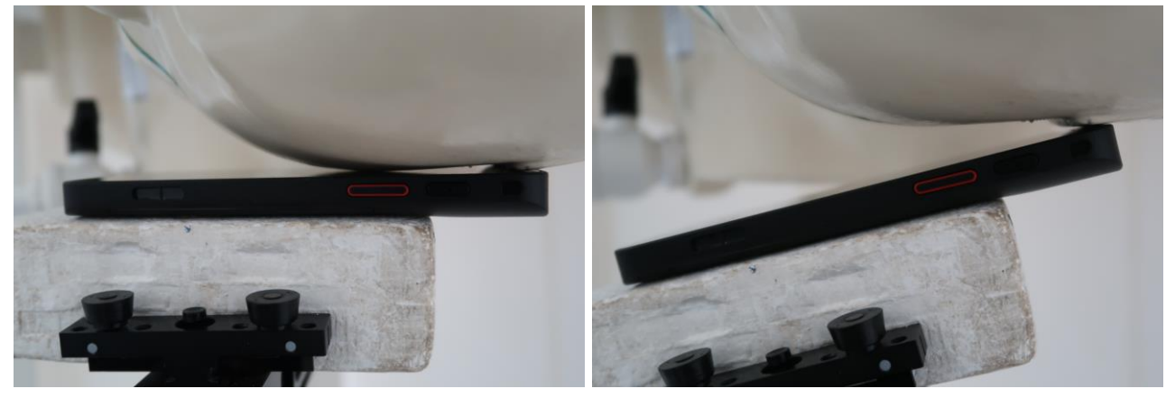
Left Cheek at 0mm