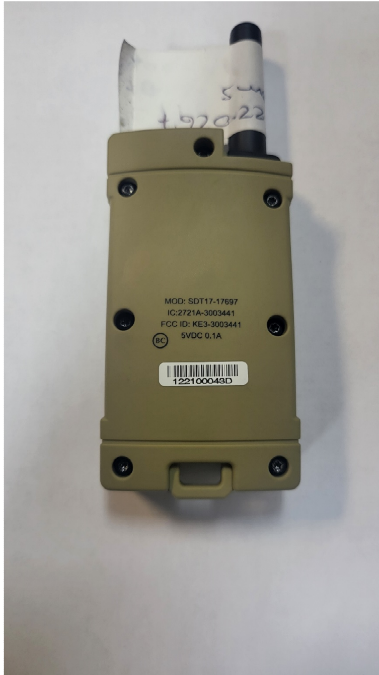
Figure 2. Sample Label Location

FCC Part 15 Certification/ RSS 210 KE3-3003441 2721A-3003441 22-0263 October 14, 2022 Radio Systems Corporation SDT17-17697