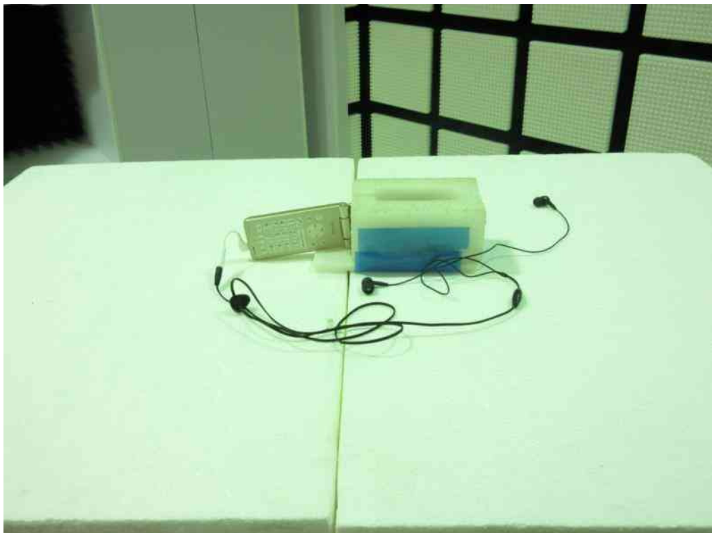
– Y-axis –