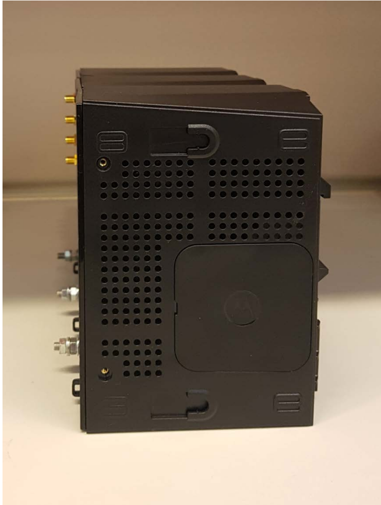
Side View (Right)