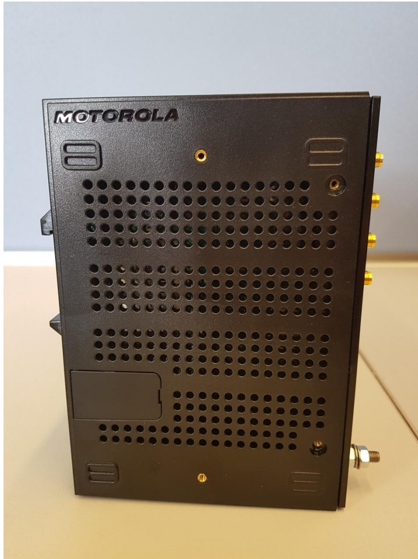
Side View (Left)