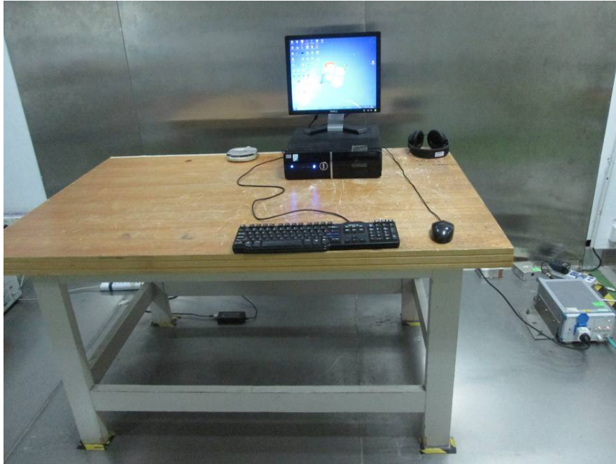
Conduction Emissions - Side View