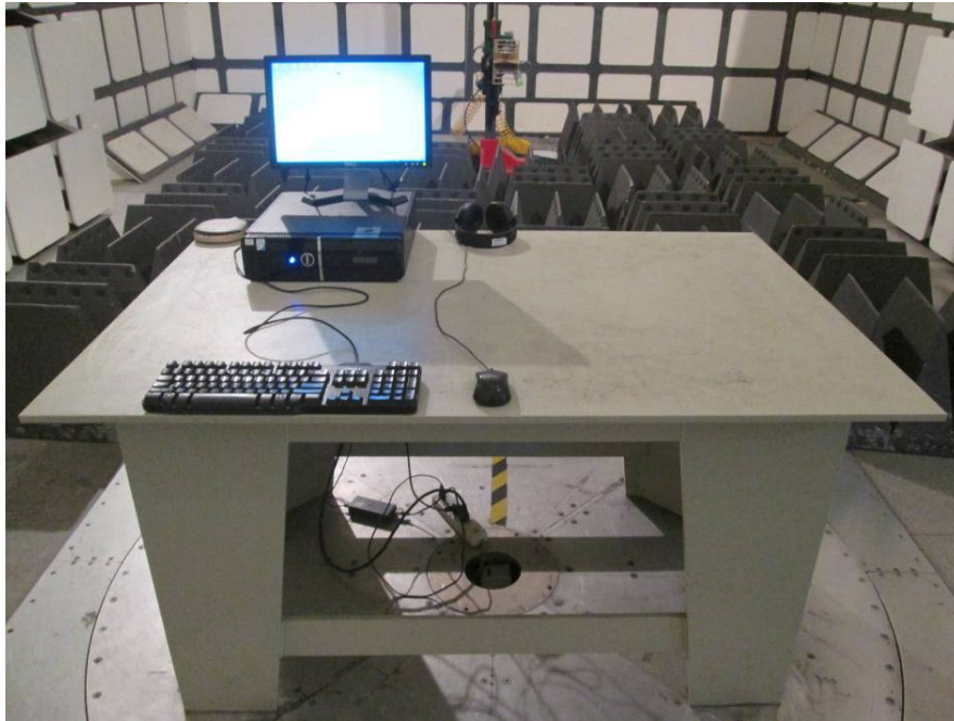
Radiated Emissions – Rear View (1-25 GHz)