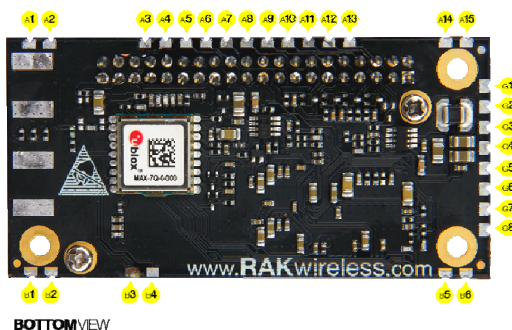
Figure 2 | RAK2245 Pin Definition

The pins of the RAK2245 shown as following figure.