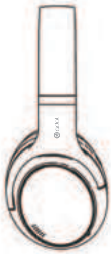
TWS-T75 蓝牙操作说明书 Wireless operation manual