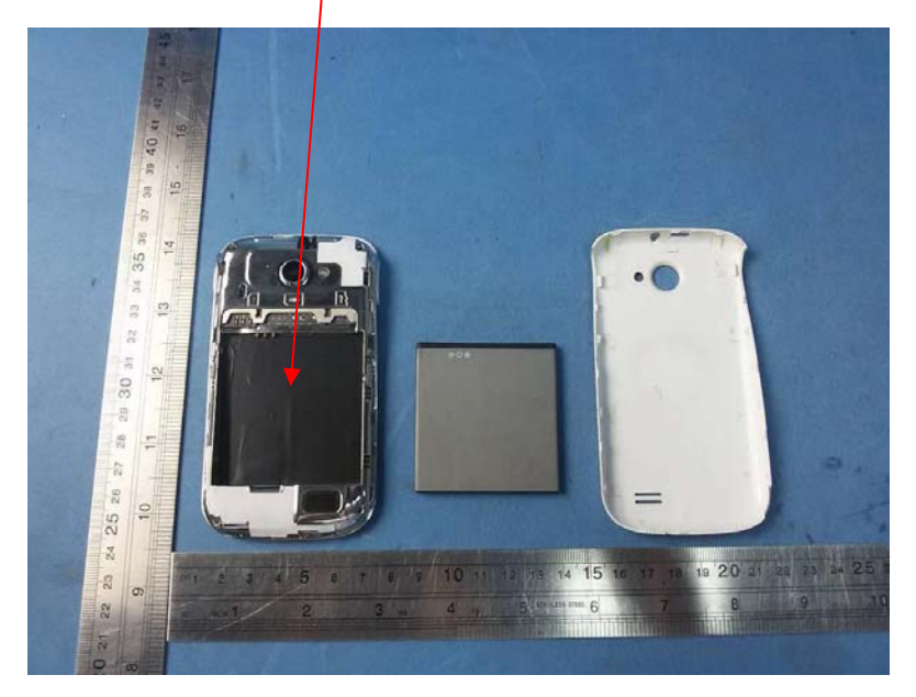
The label shown shall be permanently affixed at a conspicuous location on the device and be readily visible to the user at the time purchase (Labeling requirements per 2.925)