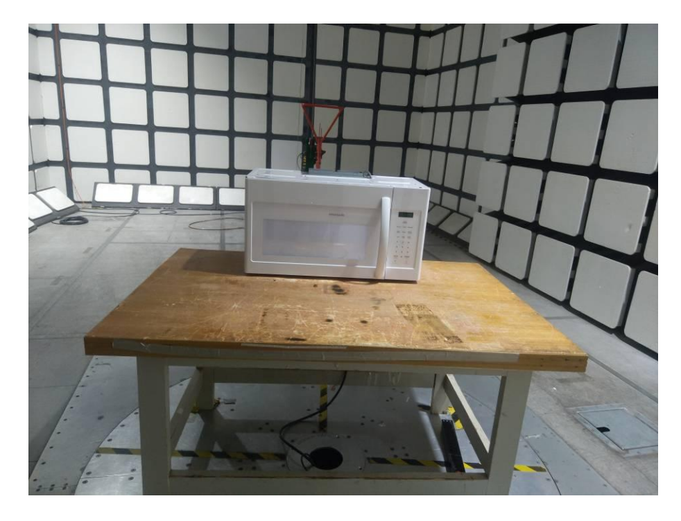
Radiated Emissions - Front View (30 MHz – 1 GHz)