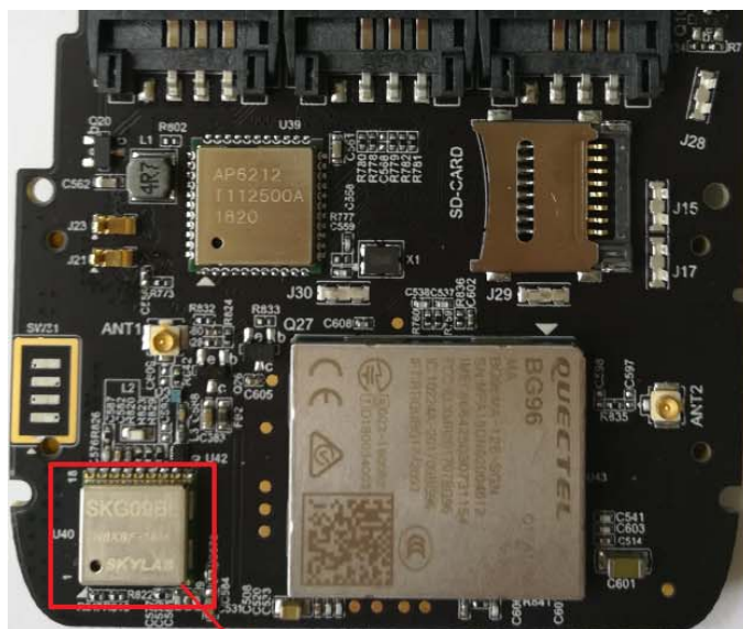
GPS module location

One carries a GPS module and the other removes it.