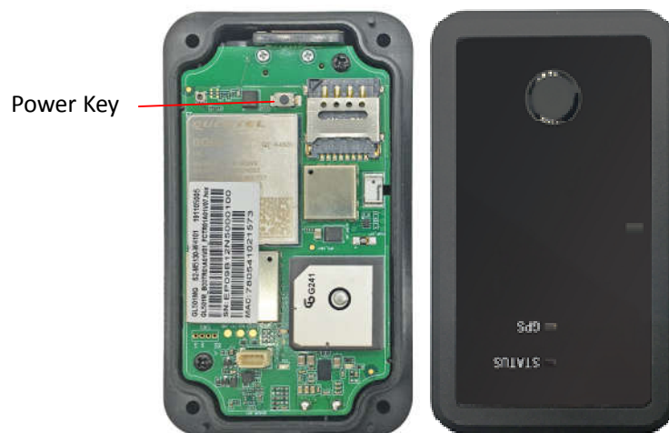
Figure 3. GL501MG GL501MG_T GL501MG_S Battery Switch and Key

To turn on: Long press the key for more than 3 seconds.