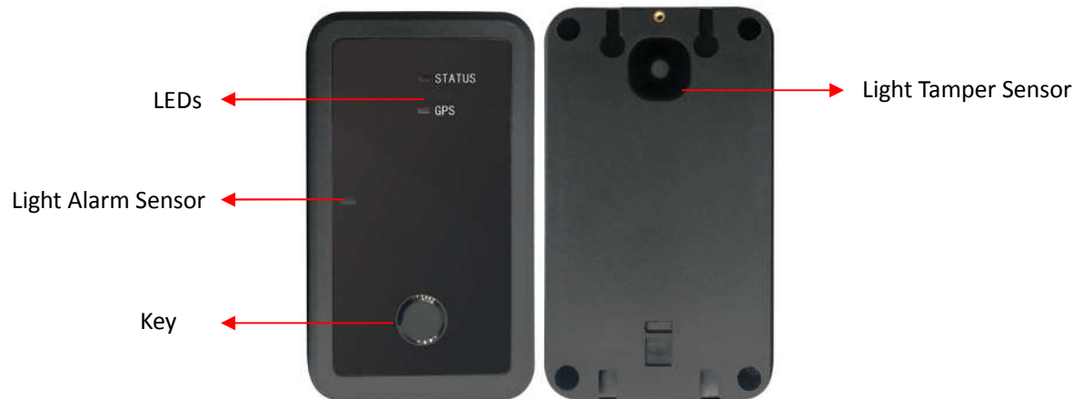
Figure 1. GL501MG GL501MG_T GL501MG_S Product View