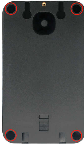
Figure 2. GL501MG GL501MG_T GL501MG_S Screw Position

To open/close the case: Unfasten or tighten the 4 screws at backside.