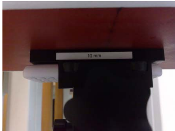
Photo of the device positioned for WR mode measurement –back facing phantom. The spacer was removed before the start of the measurements.

The device was placed in the SPEAG holder using the Nokia spacer and, in sequence, the back, display and each of the 4 edges was positioned 10.0mm away from the flat phantom. The spacer was removed before the start of the measurements.