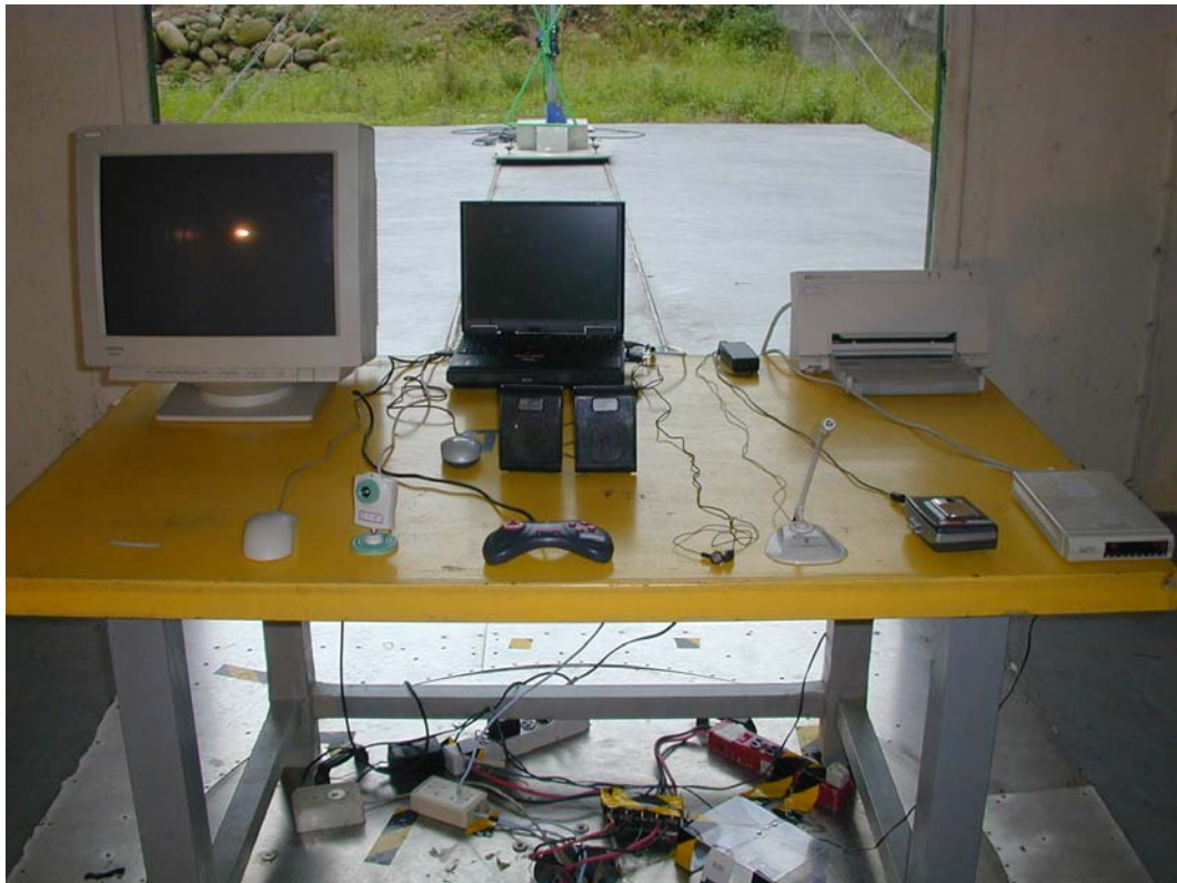
Back View of Radiated Test (Mode 2)