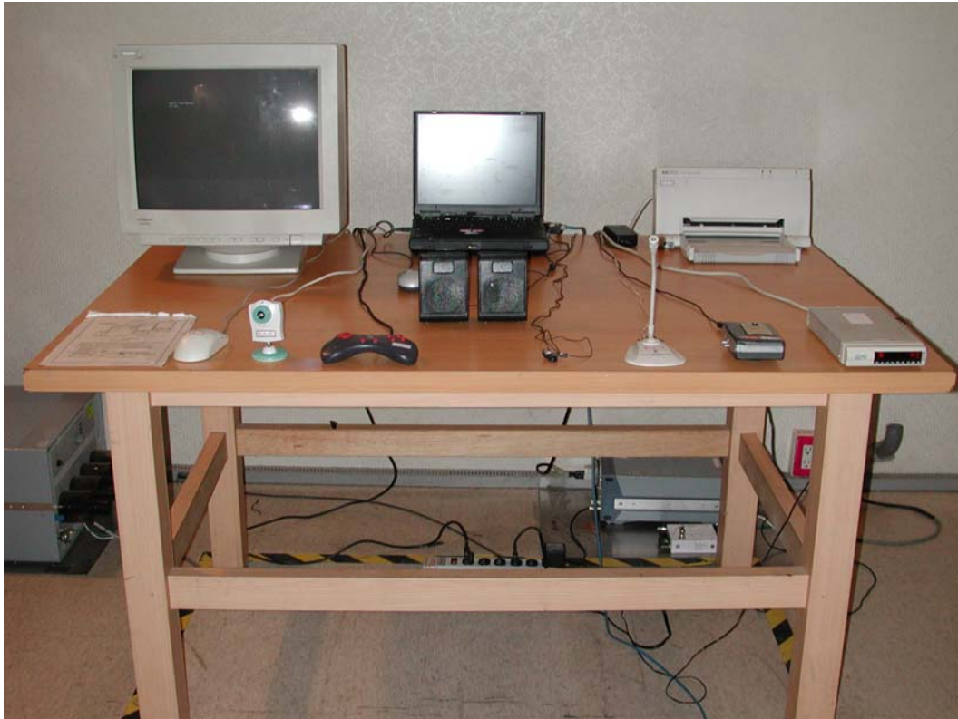
Back View of Conducted Test (Mode 1)