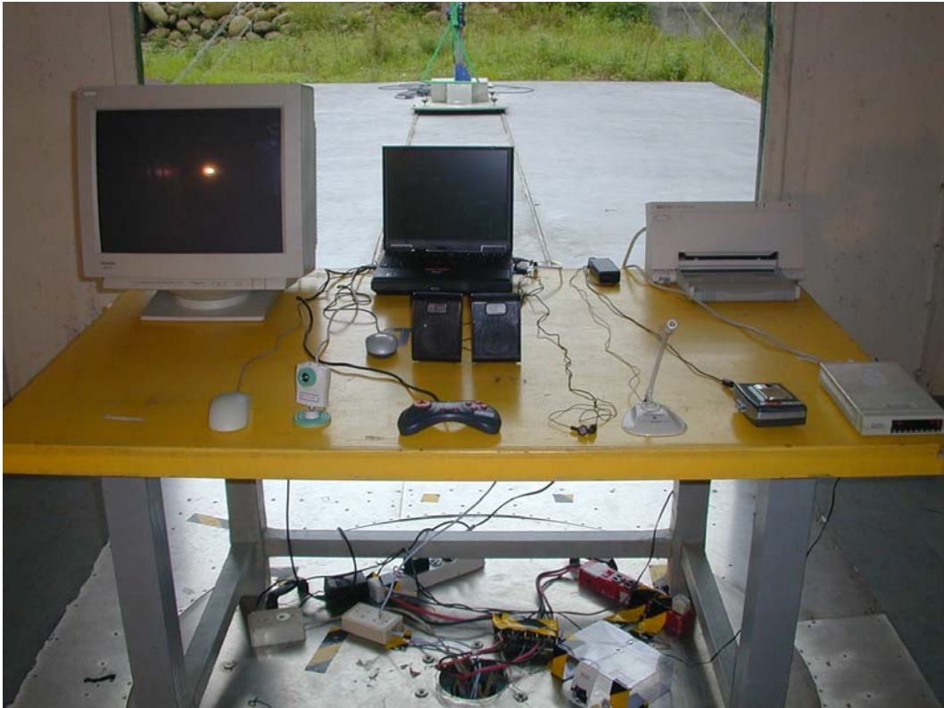
Back View of Radiated Test (Mode 1)