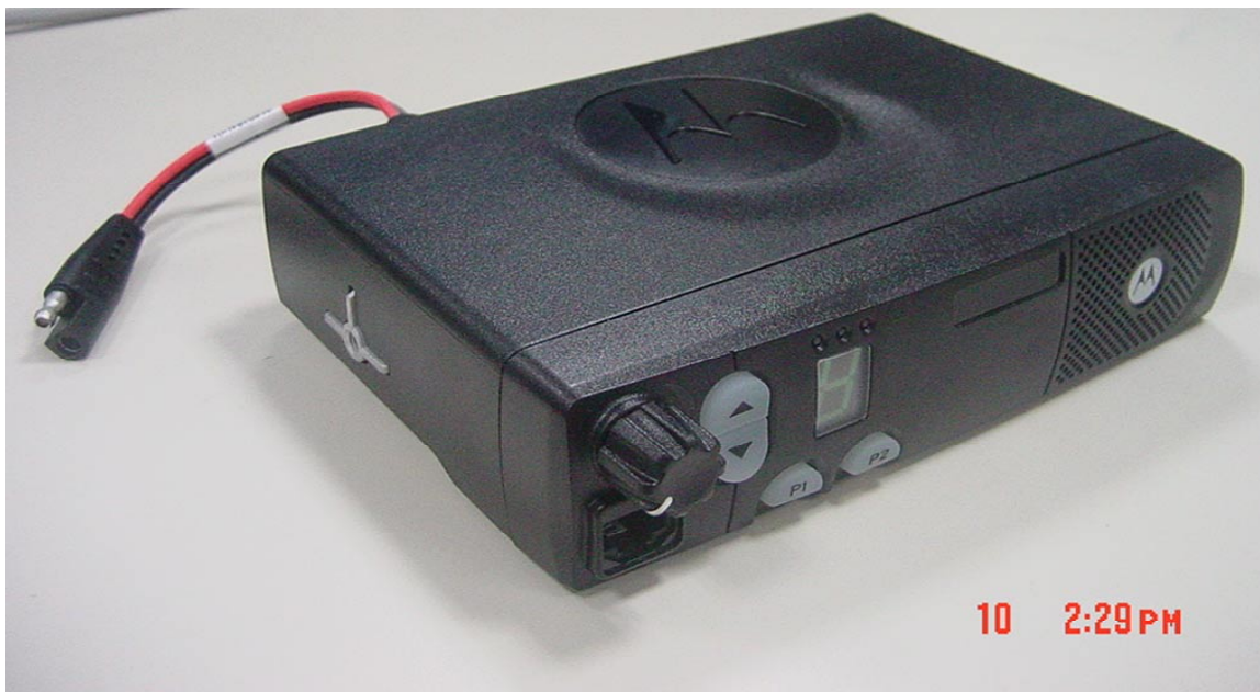
Figure 3-1: Front and side views of complete radio.