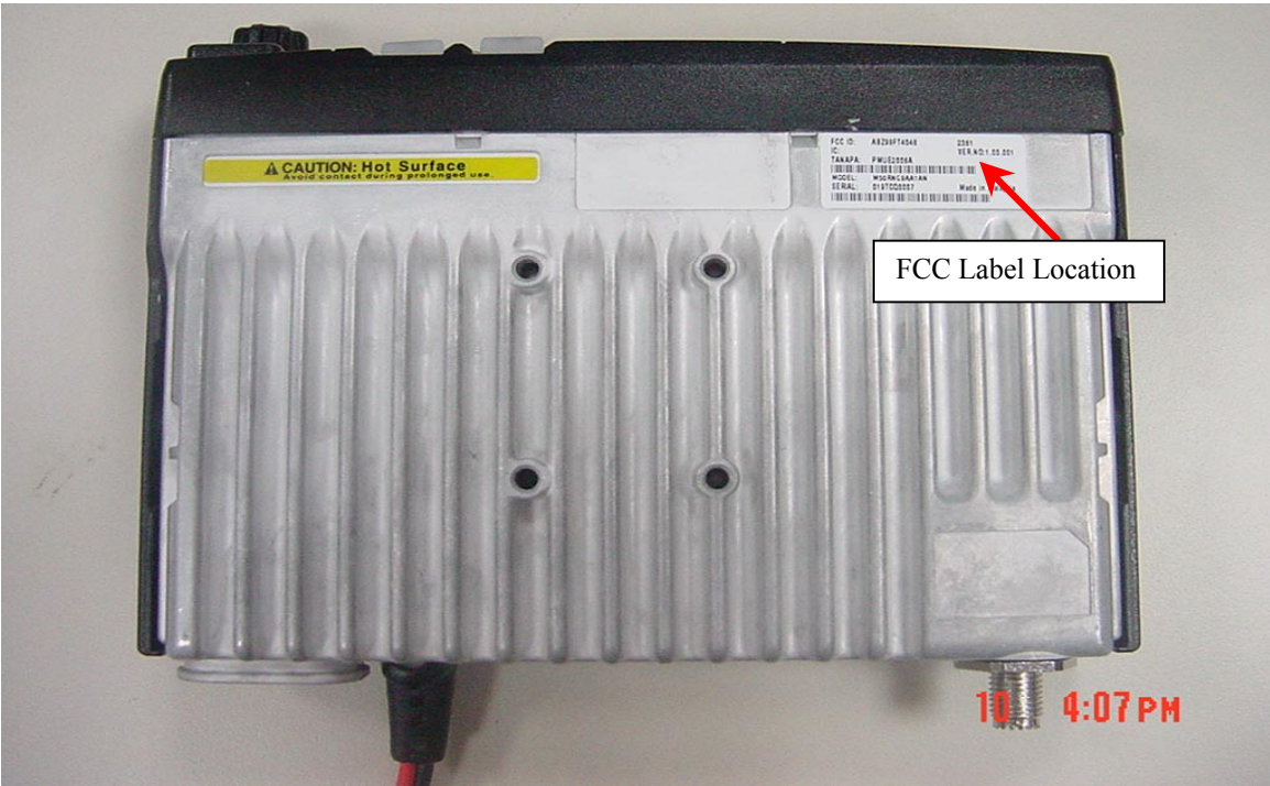
Figure 3-4: Rear view of complete radio showing FCC Label location.