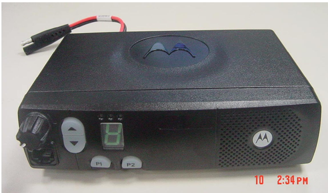
Figure 3-2: Front view of complete radio.