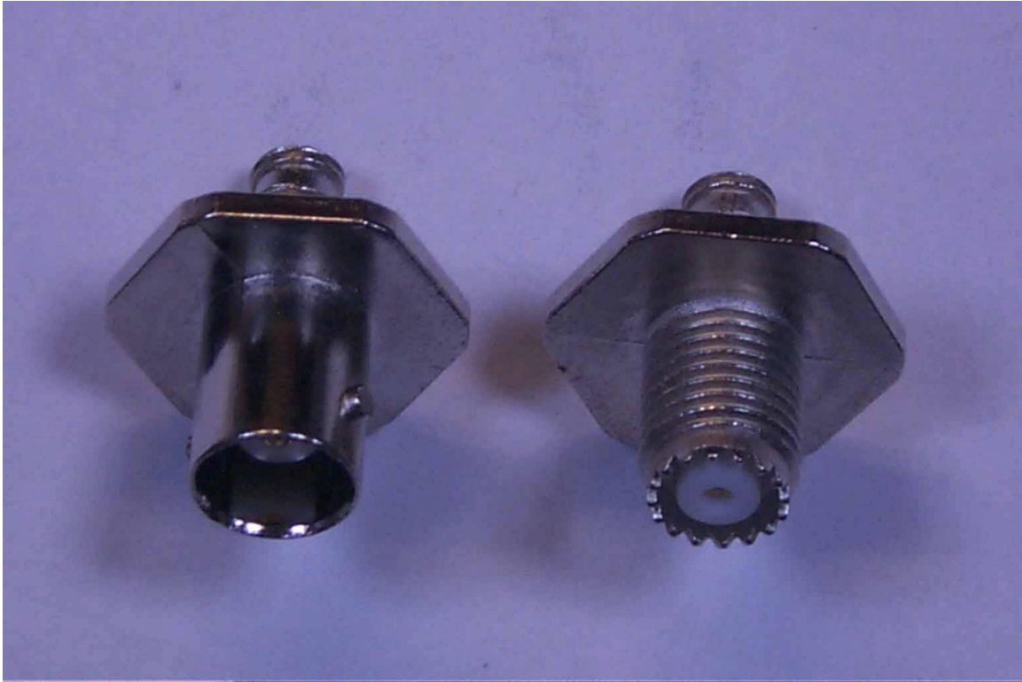
Figure 3-6: Antenna connector options, BNC on left, mini-UHF on right.