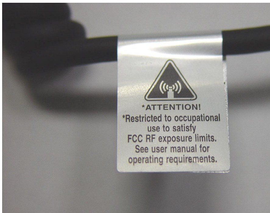
Figure 3-6: Close-Up of RF Safety Label