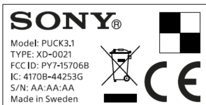
Fig.1 Label Drawing