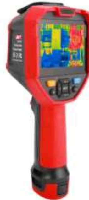
UTi730V/UTi720V Quick Start Guide of Thermal Imager