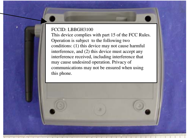
Model: GH3110 & GH3100