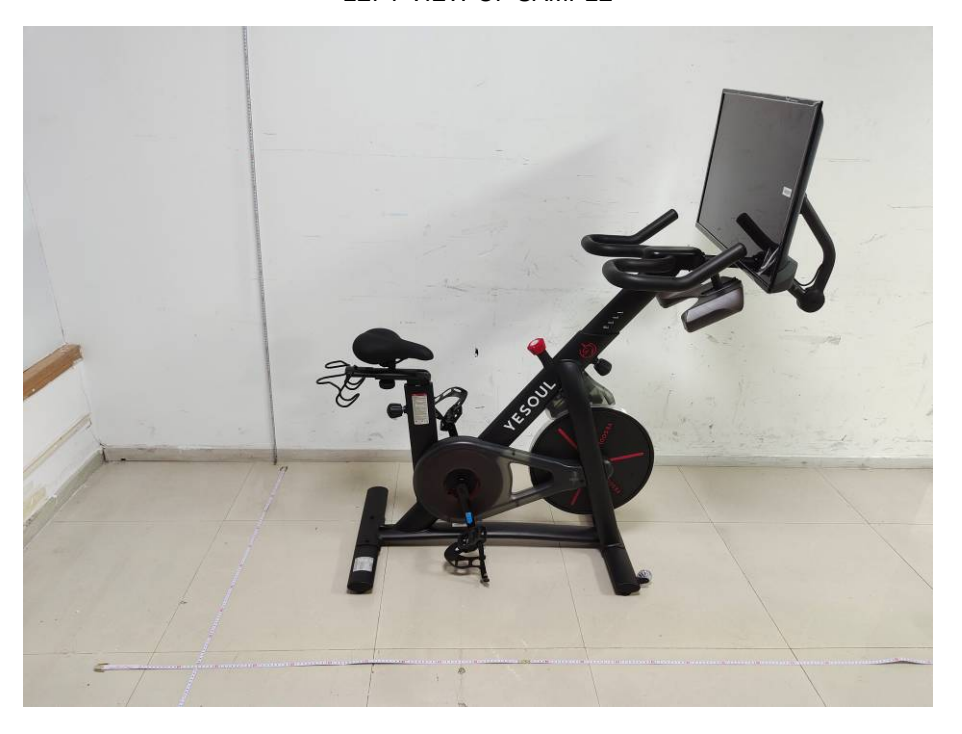
RIGHT VIEW OF SAMPLE