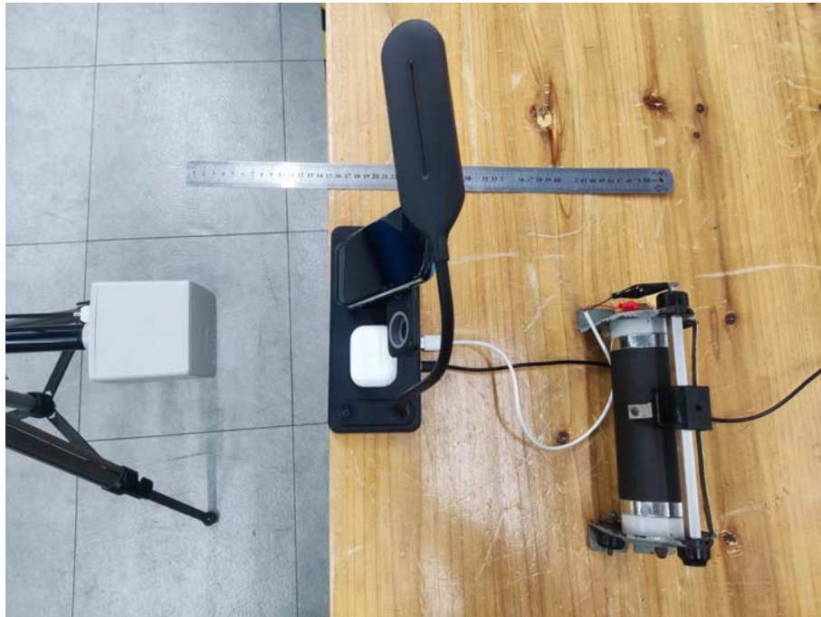
Test Position A-15cm from the edge of EUT to the geometric center of the probe