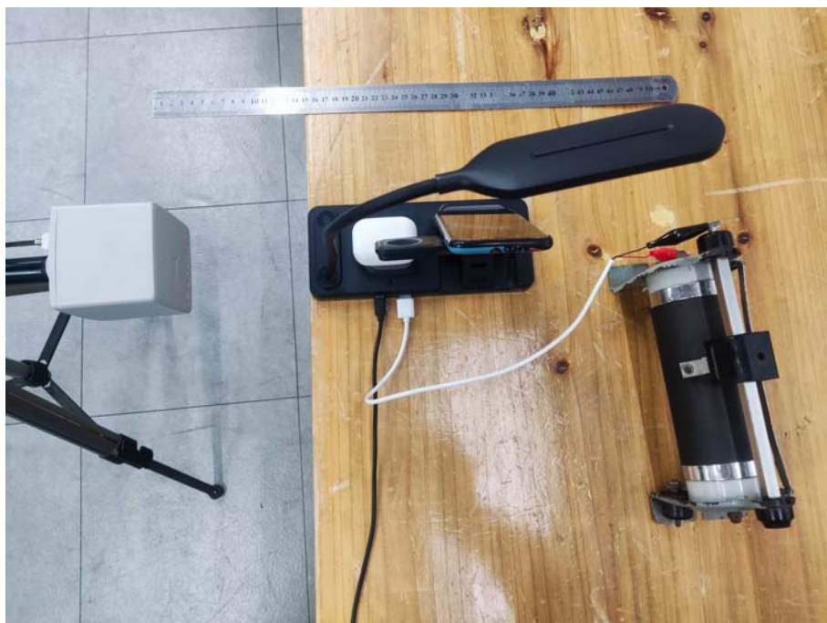
Test Position D-15cm from the edge of EUT to the geometric center of the probe