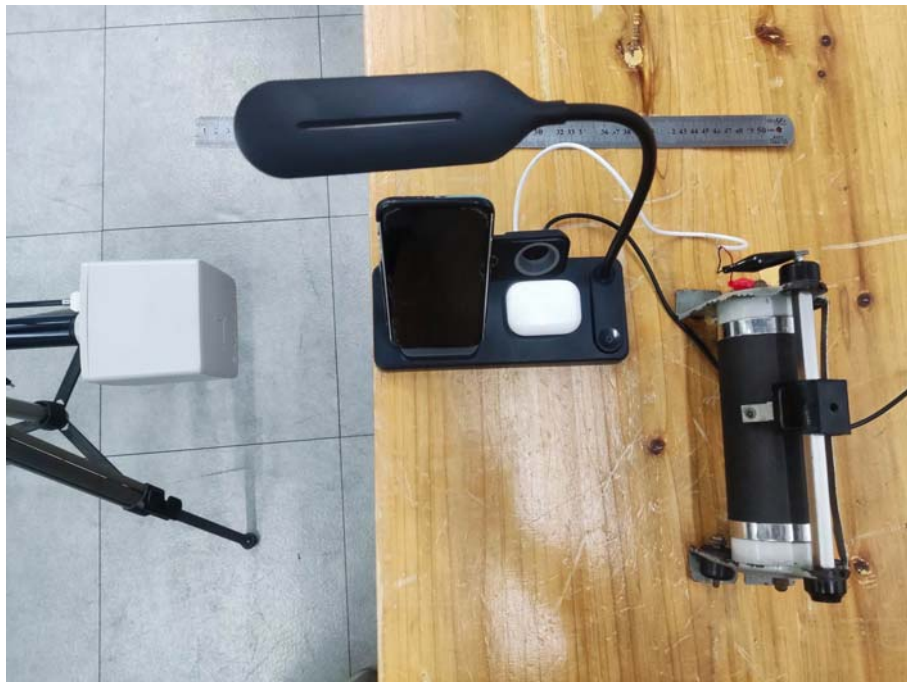
Test Position B-15cm from the edge of EUT to the geometric center of the probe