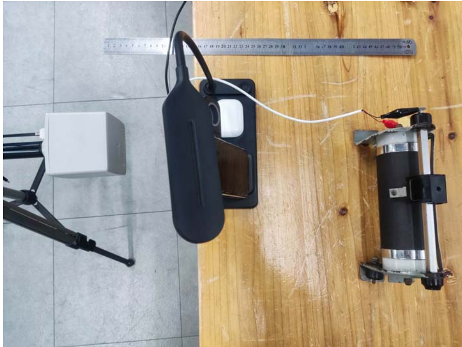
Test Position C-15cm from the edge of EUT to the geometric center of the probe