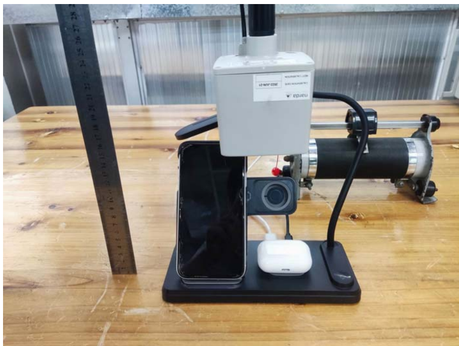
Test Position F-20cm from the edge of EUT to the geometric center of the probe