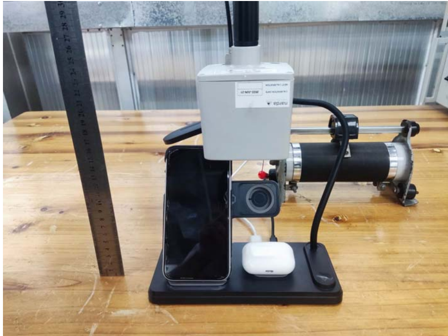
Test Position E-15cm from the edge of EUT to the geometric center of the probe