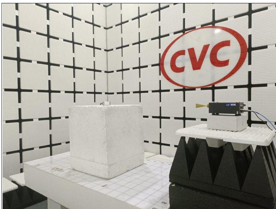
RADIATED EMISSION TEST (Above 40GHz)