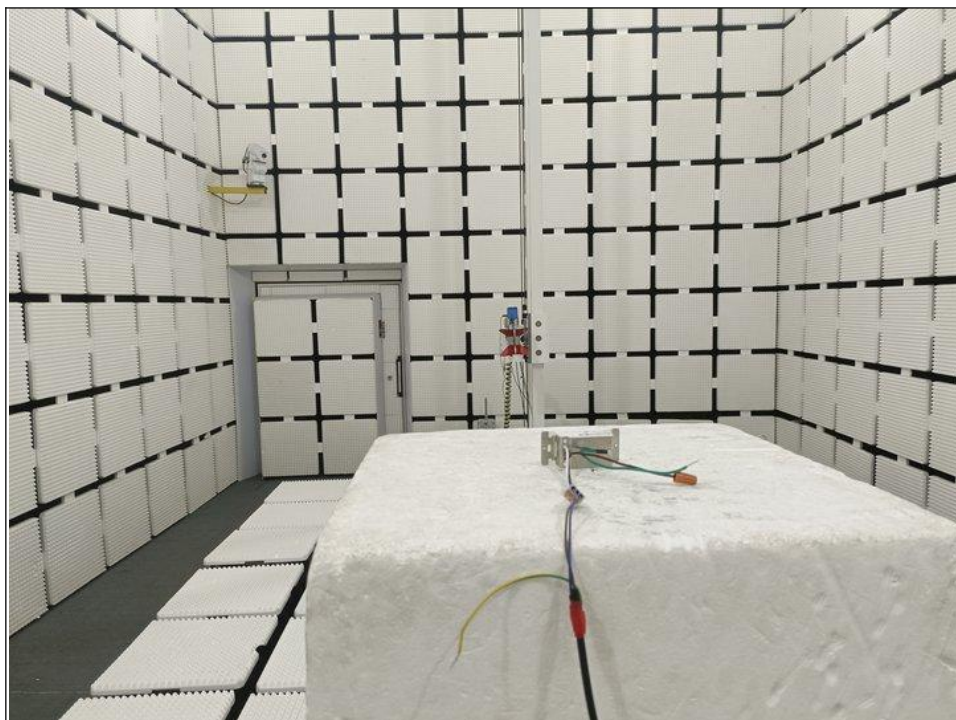
RADIATED EMISSION TEST (1GHz-40GHz)