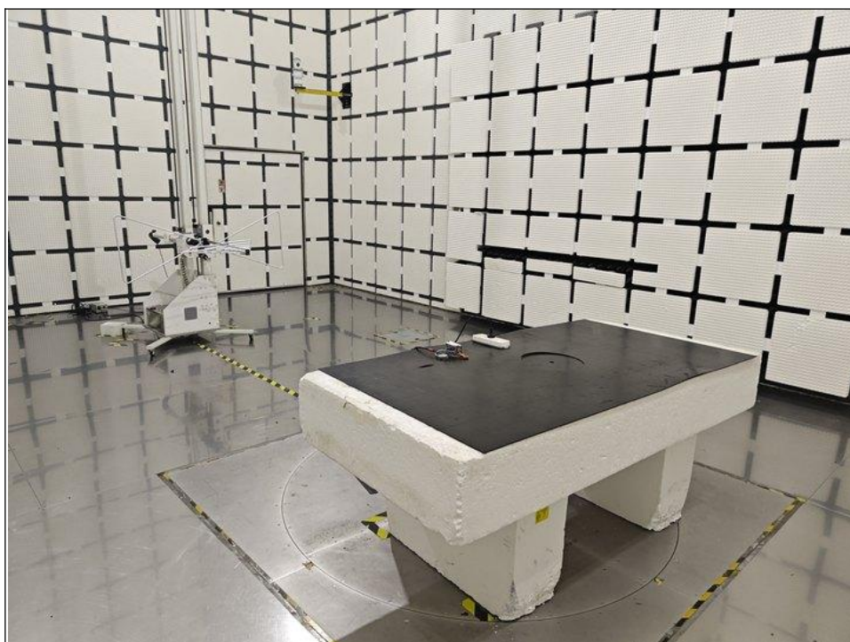
RADIATED EMISSION TEST (Below 1GHz)