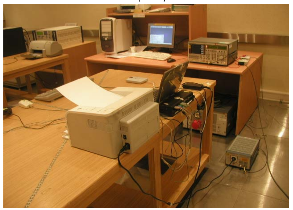
Pic. 2 Conducted Emission (Rear)