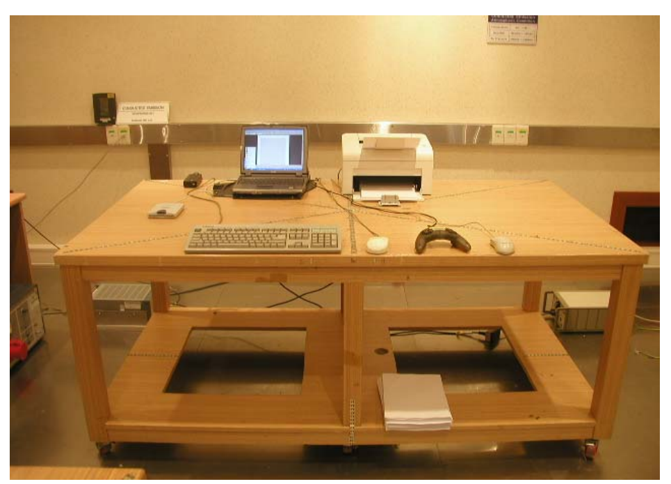
Pic. 1 Conducted Emission (Front)