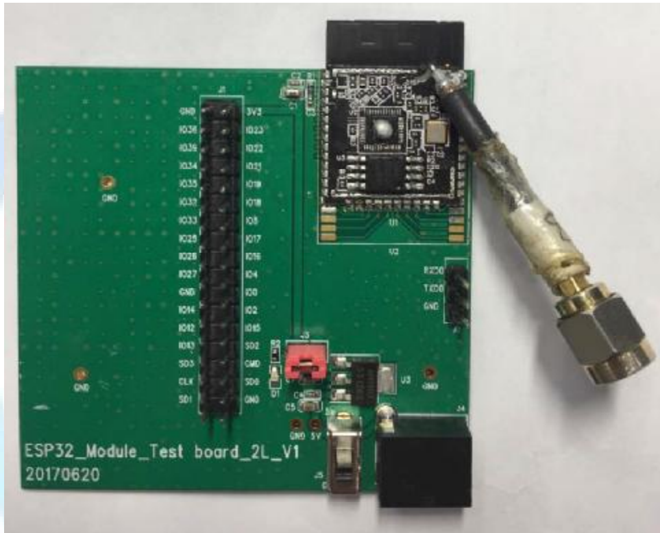
Picture 1 Constituents of EUT