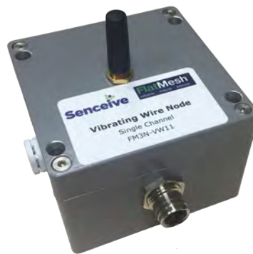
Figure 1.1: Photo of FM3N-VW11

Readings can be scheduled anywhere between a few seconds to twelve hours with a time increment of one second, but it should be noted that vibrating wire sensors usually require a delay of at least 30-45 seconds between readings for optimum performance.