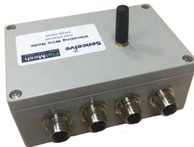
Figure 1.2: Photo of FM3N-VW41