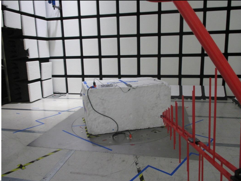
RADIATED FRONT PHOTO (BELOW 1 GHz)