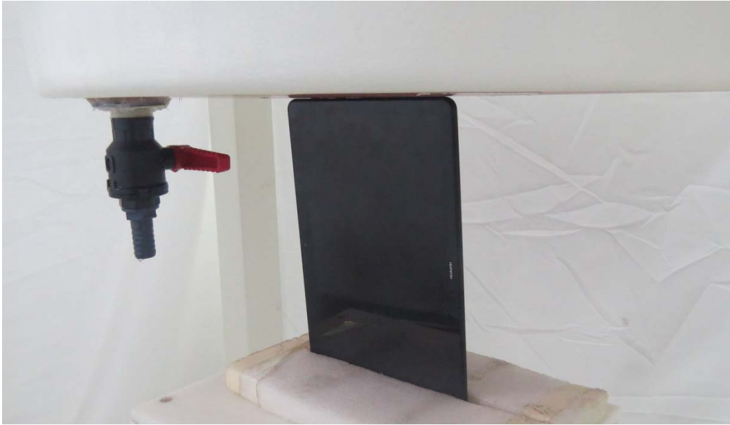
Picture 3: Right Side, the distance from handset to the bottom of the Phantom is 0mm