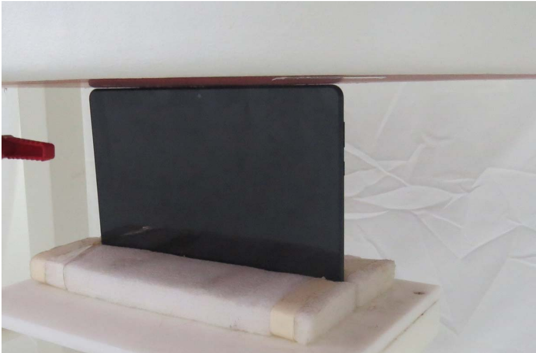
Picture 4: Top Side, the distance from handset to the bottom of the Phantom is 0mm