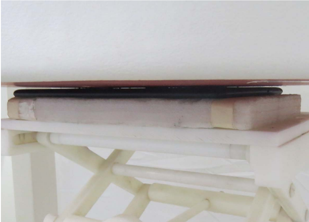
Picture 1: Back Side, the distance from handset to the bottom of the Phantom is 0mm