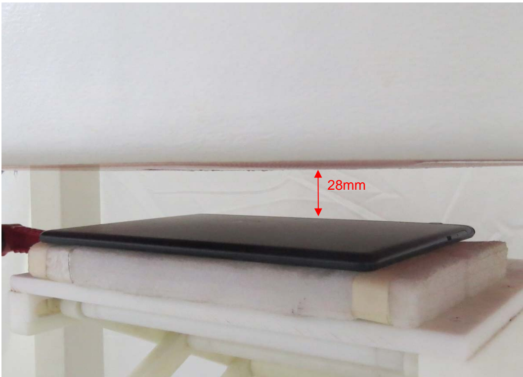
Picture 2: Back Side, the distance from handset to the bottom of the Phantom is 28mm