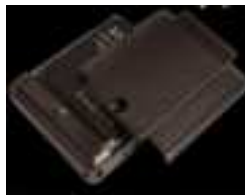
Device Cover with Clip