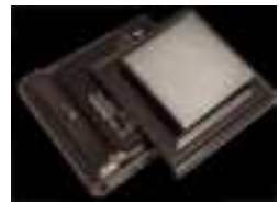
Device Cover with Magnet