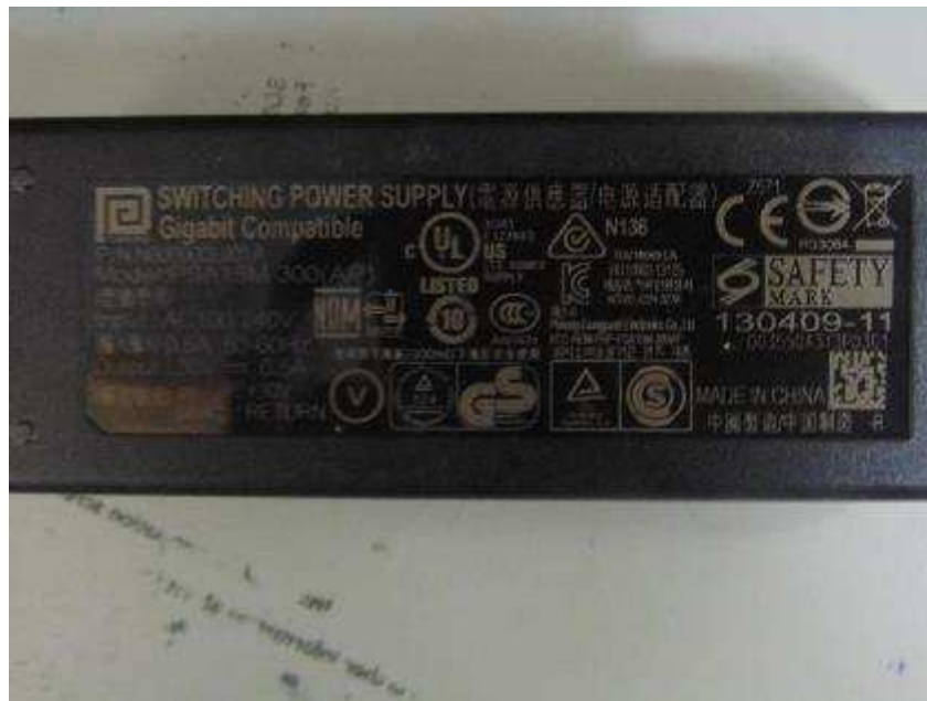
Figure 6: Photograph of the AC Adapter showing model no