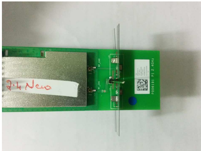
Figure 4: Photograph of Serial number of product used for Conducted tests