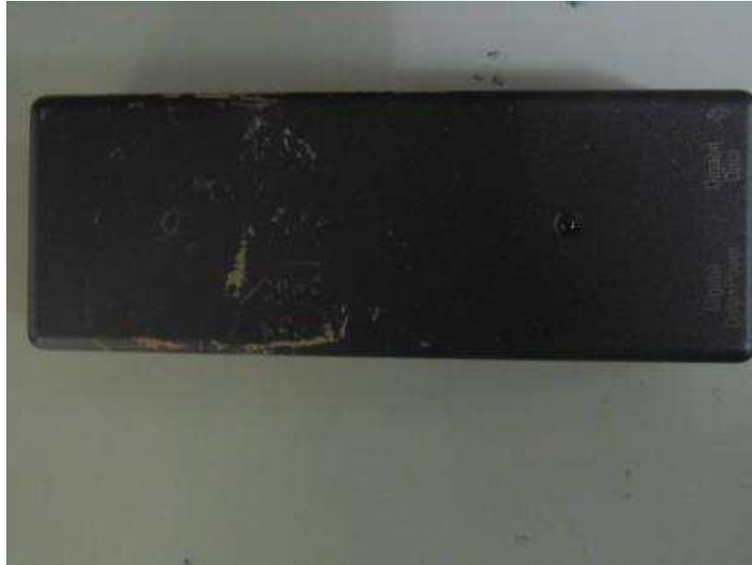
Figure 7: Photograph of the AC Adapter top view