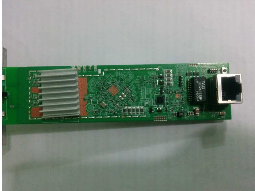
Figure 1: Photograph of the EUT – Top Side