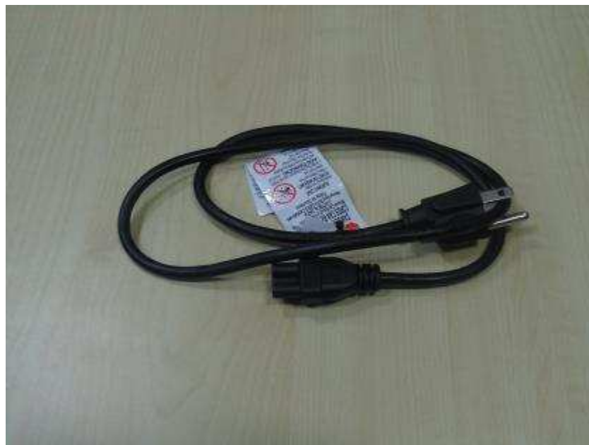
Figure 8: Photograph of the AC Adapter Power cord