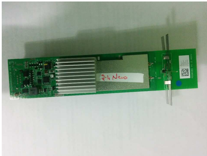
Figure 2: Photograph of the EUT – Bottom Side