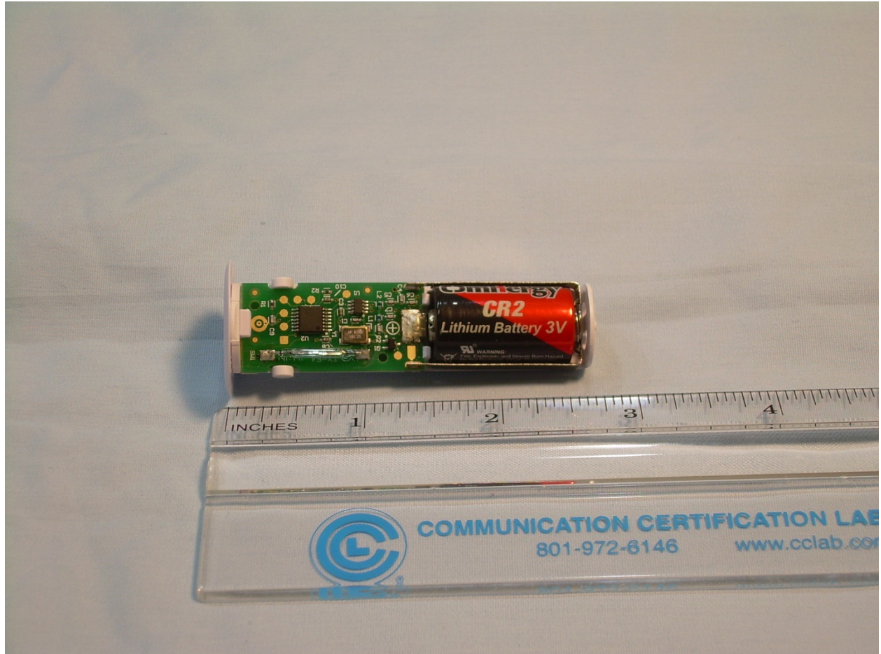
View with the Housing Removed