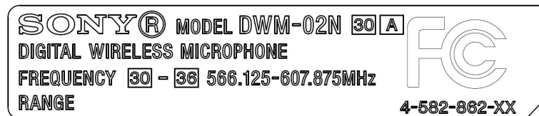
Label Upper (30A UC)