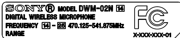
Label Upper (14 UC)