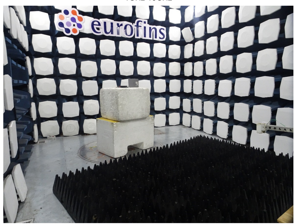
18GHz - 26.5GHz