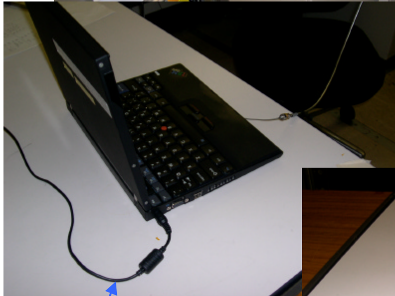
AC Adapter line