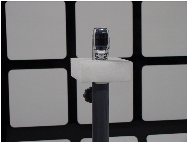
Phone Vertical (Flip Closed)