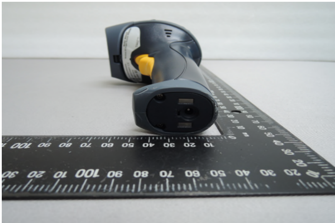
Side View of EUT – 2