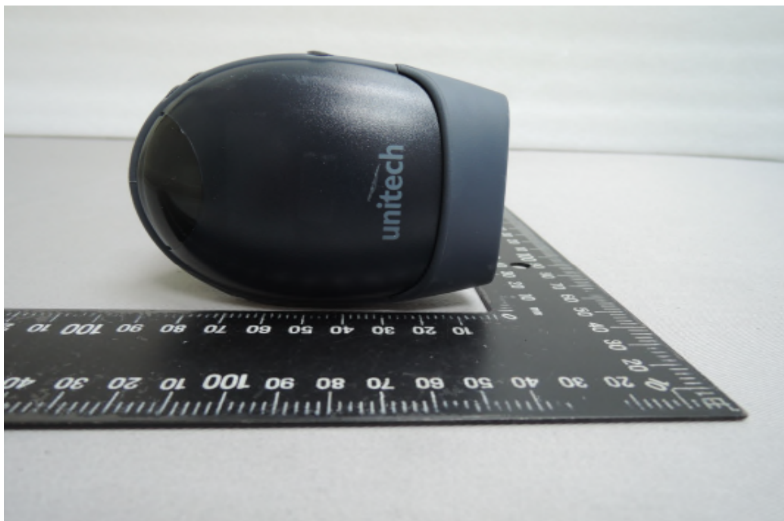
Side View of EUT – 4