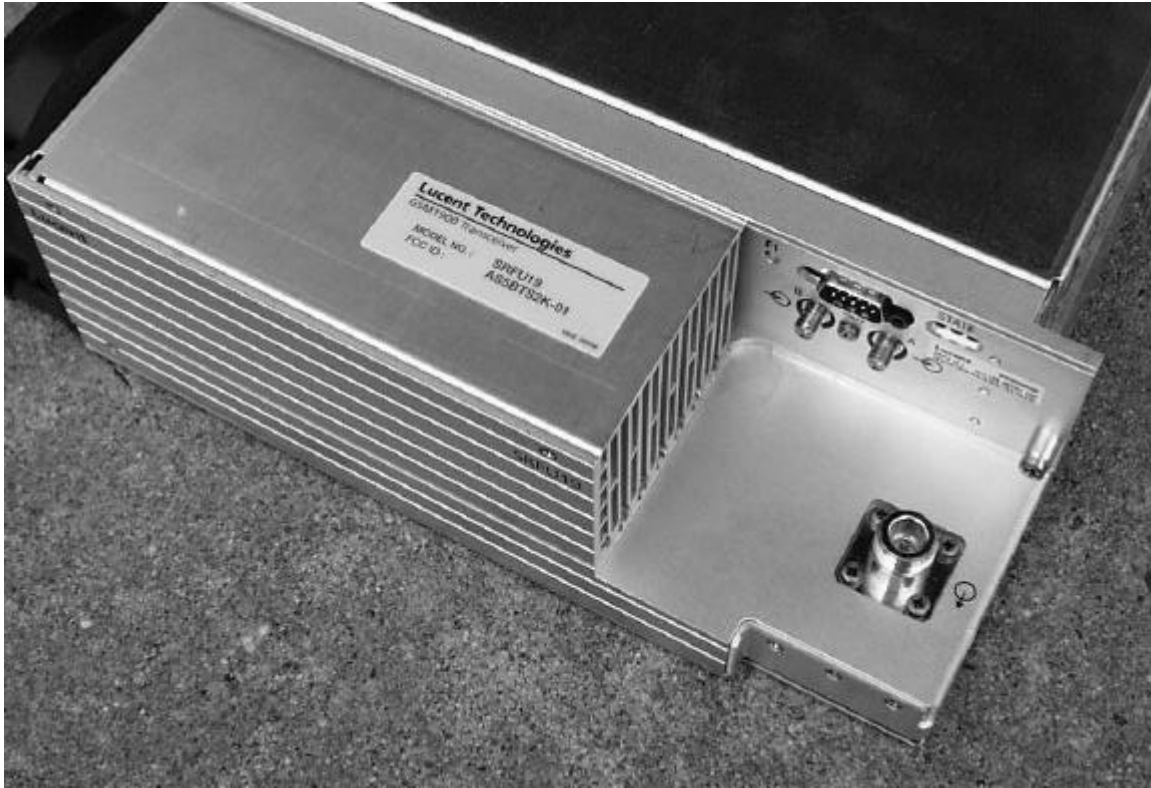
Photograph of SRFU19 Showing FCC ID Label