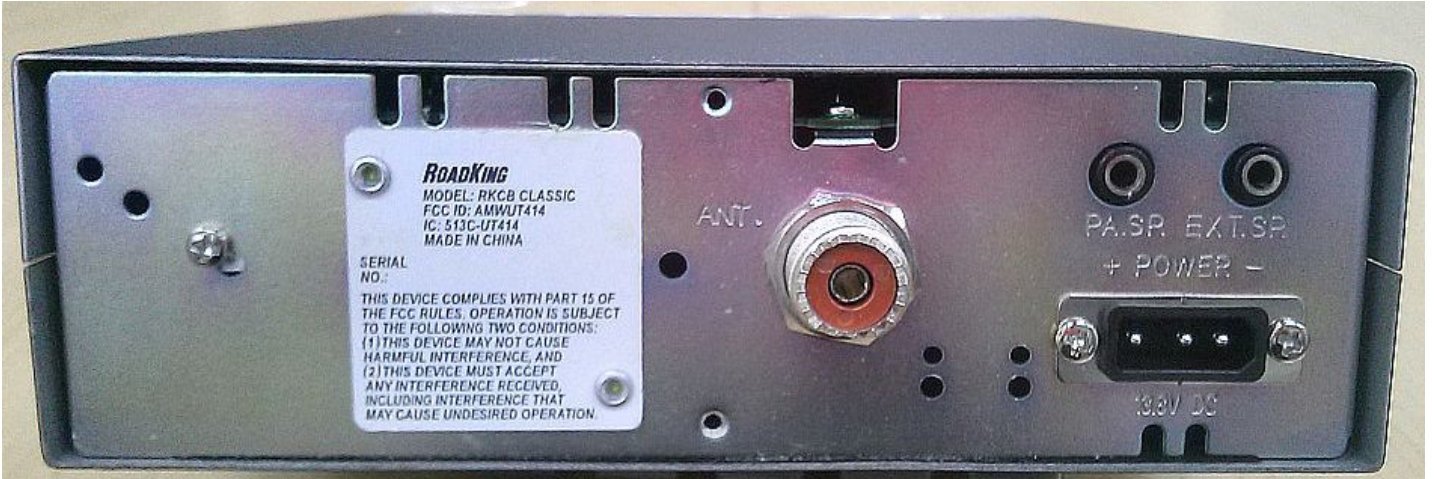
Rear View - Label Location