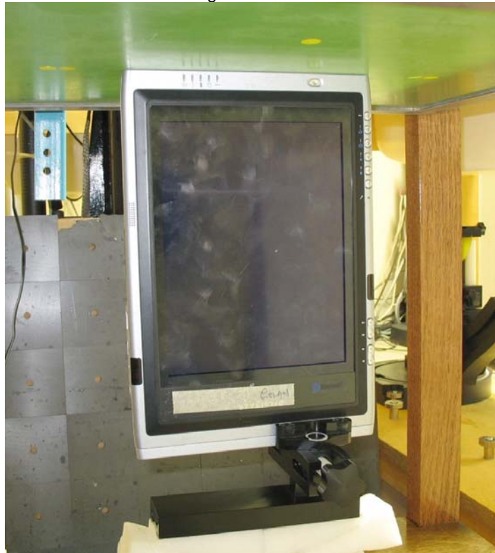
Edge On Position