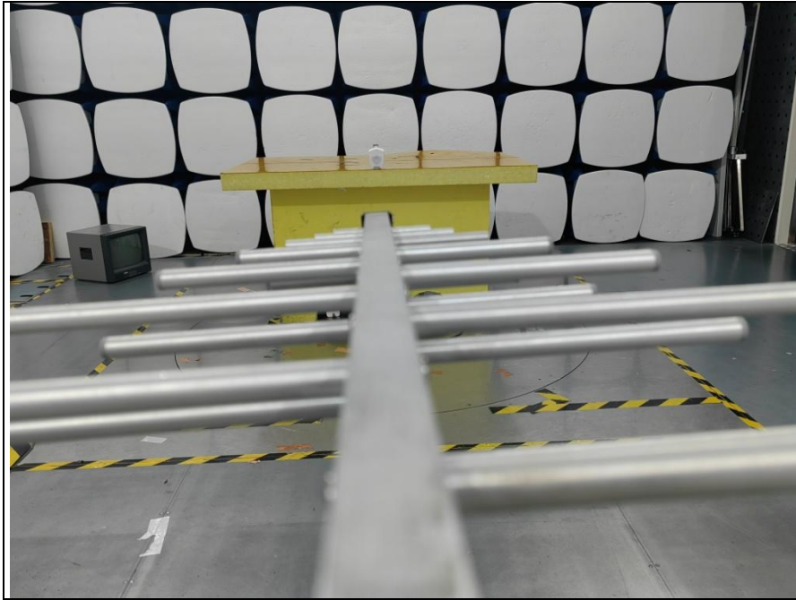
Radiated spurious emissions at frequencies up to 1 GHz