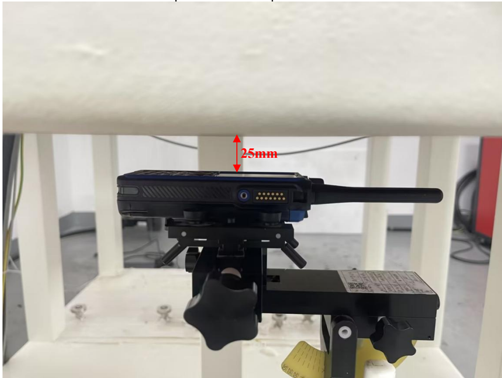
Body Back Touch with all accessories

Face Up with 2.5 cm Separation Distance.