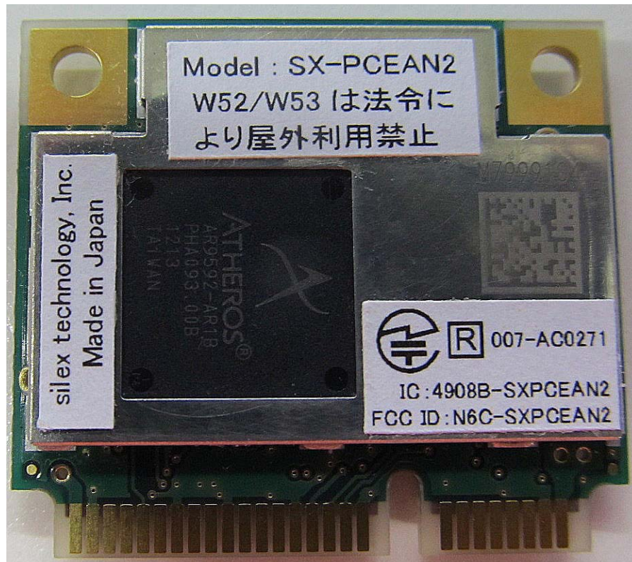
Bottom with shielded