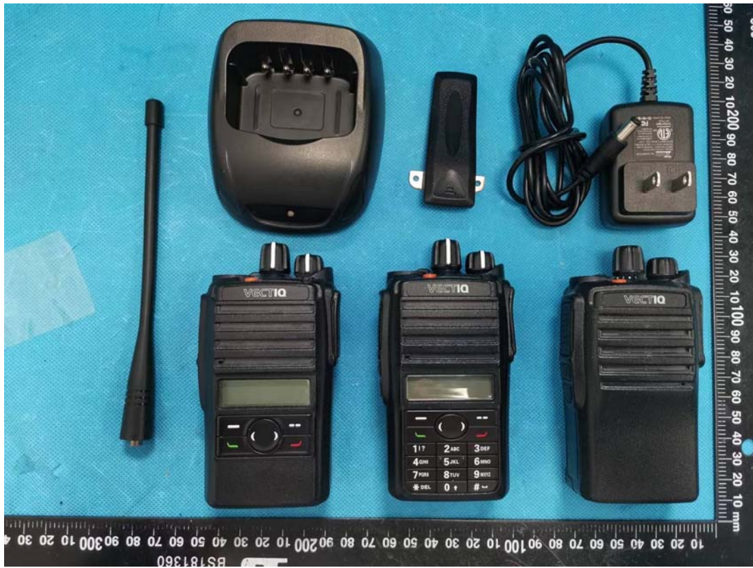
EXHIBIT B - EUT EXTERNAL PHOTOGRAPHS