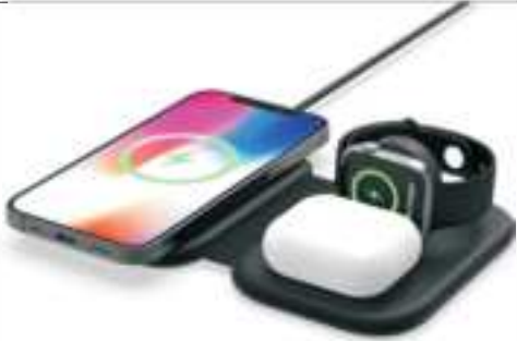
3 Devices Charging