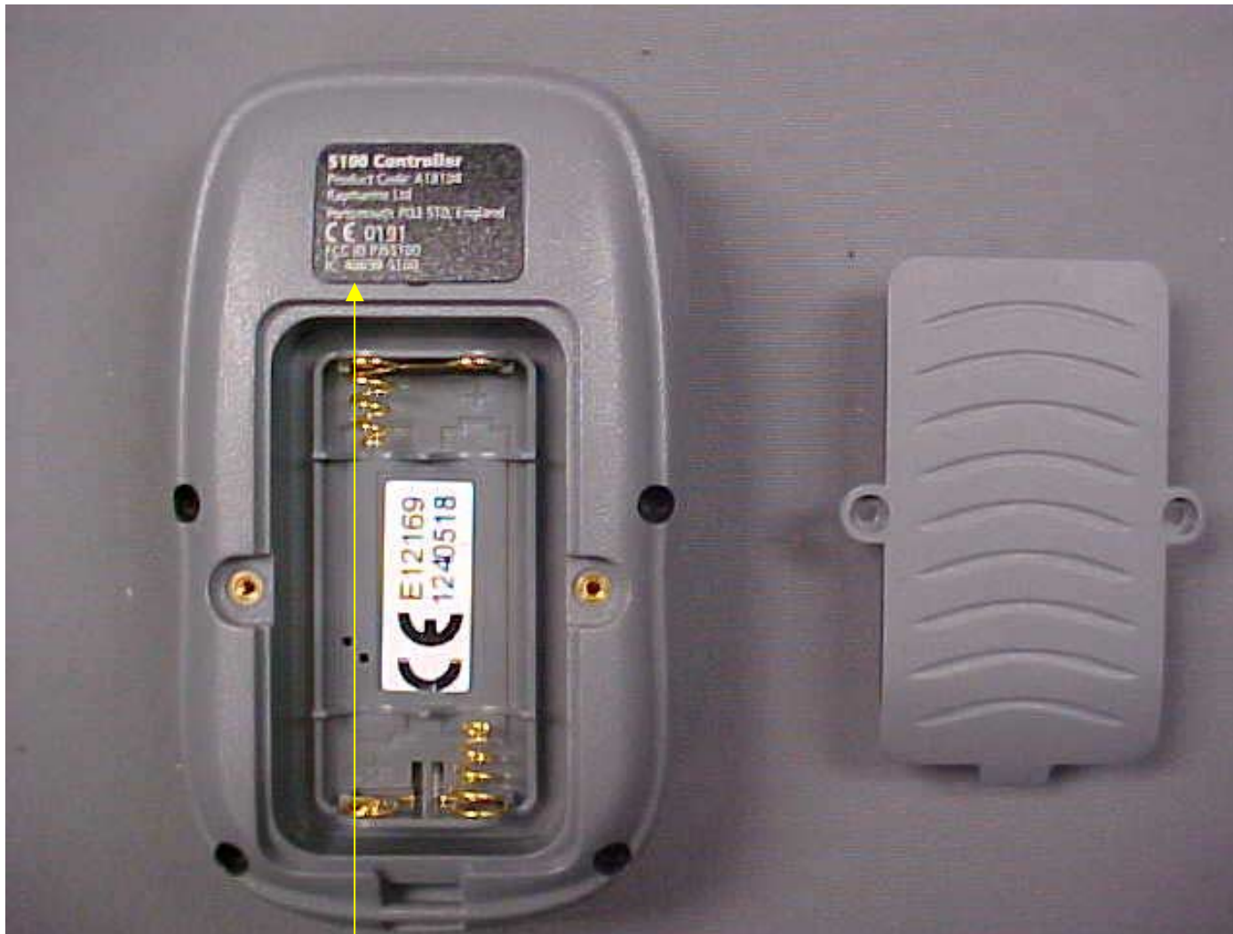
S100 Controller: FCC and IC label location